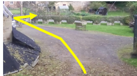
Follow track to road, Turn Right