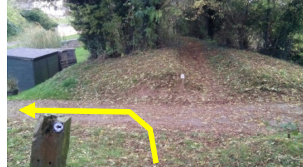
Left at track